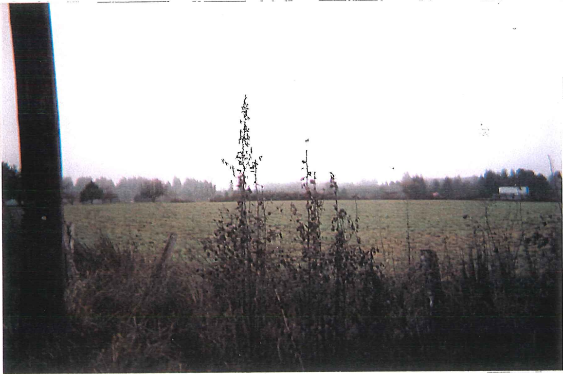
Riverside Drive Area looking N along Walnut, just north of Riverside Dr.