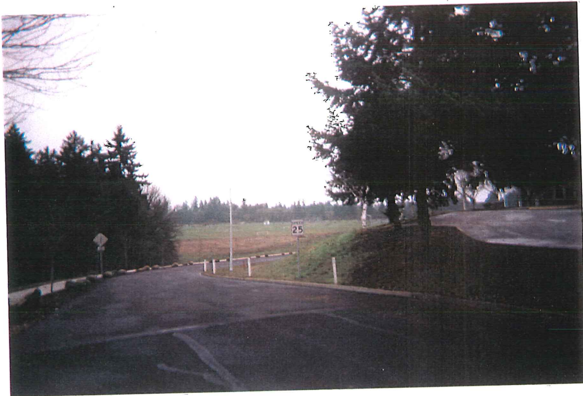
New Soccer and Ball Fields on recent Floodplain additions to Joe Dancer Park