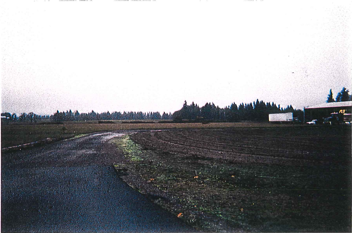
Bunn's Village Along Lone Oak Road