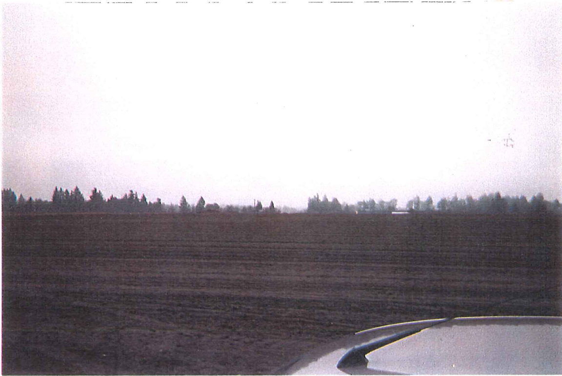
Riverside South area across Riverside Drive from TL 2100 2101