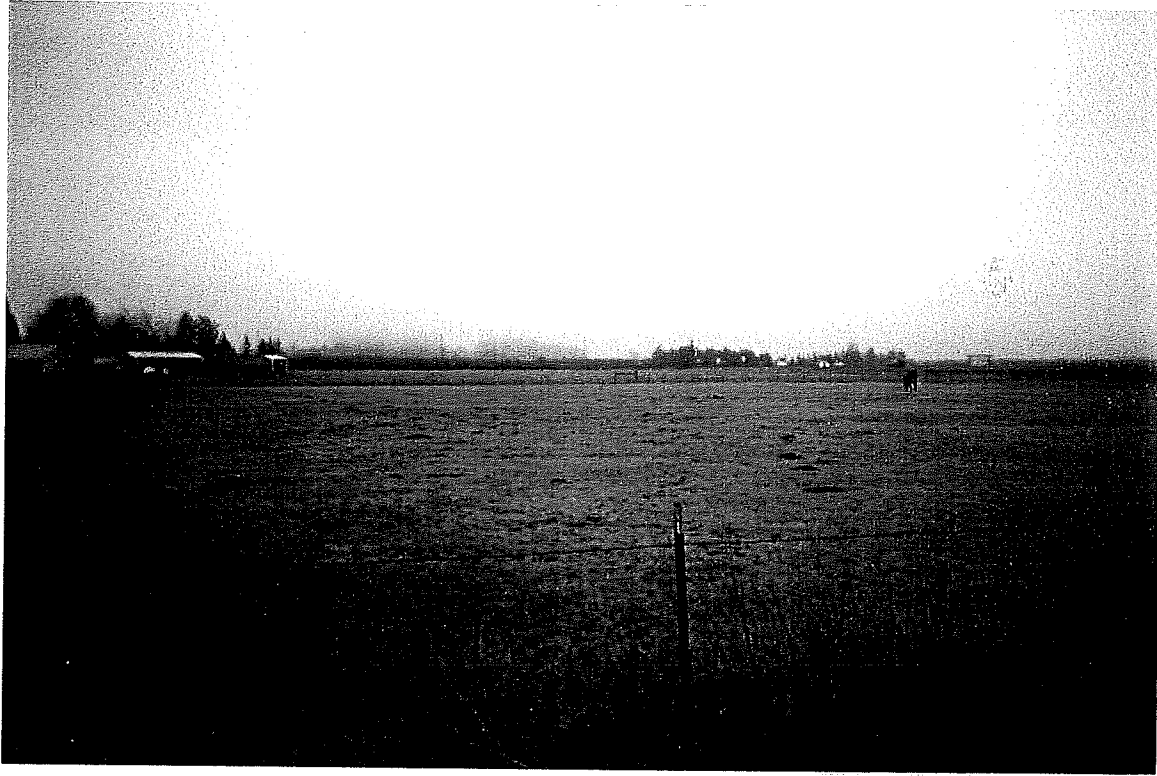
Stubbed Road from existing UGB to Old Sheridan Road Area