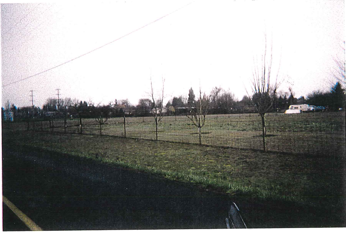
Booth Bend Road Area from Morgan Lane