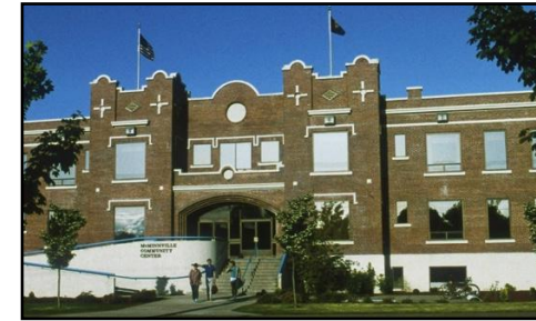
Community Center opens and Parks & Recreation Department headquarters move from City Hall, recreation programming begins and McMinnville Senior Citizens, Inc. moves in.

Due to aging facilities City Council funds Parks & Recreation Facilities Master Plan and established advisory committee.