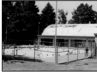
A 30 yard outdoor pool and 20 yard indoor pool were built. McMinnville Swim Club was founded.

McMinnville's first community indoor pavilion was constructed on the site of the present day Aquatic Center – it served as the center of community activity until it was demolished in 1922.