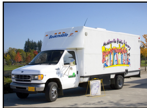
Children's Bookmobile - 2001 Project

A non-profit 501(c)(3) public benefit Organization. Gifts to the foundation are tax deductible.