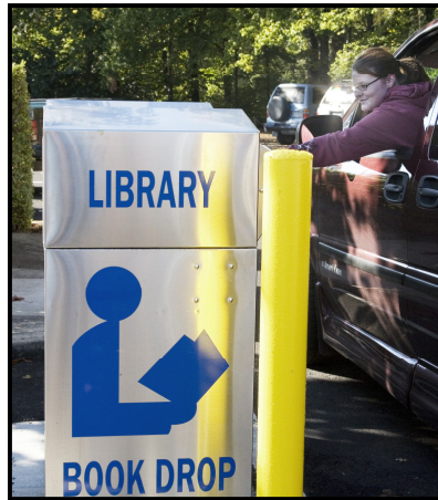
Book Drops - 2007 Project

The Library Foundation of McMinnville 225 NW Adams Street McMinnville, OR 97128