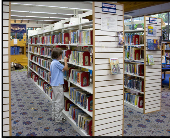
Children's Shelving - 2008-10 Project

Our public library is a vital resource to the community offering the opportunity to preserve its past, empower its citizens and inspire its future. The Library Foundation of McMinnville supports and enriches this mission through fundraising, advocacy and planned giving .