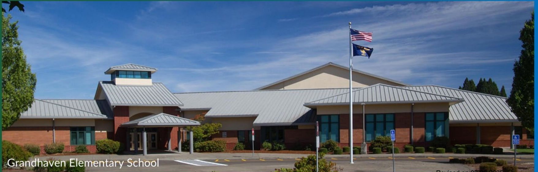
Grandhaven Elementary School