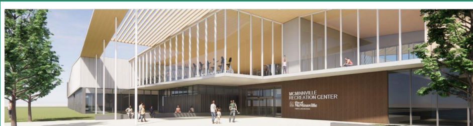
Culture, Parks & Recreation Bond