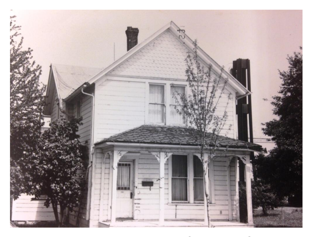
Original 1983 Survey Photo